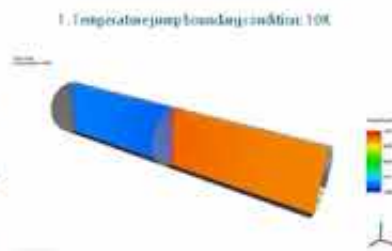
1. Temperature jump boundary condition: 10K